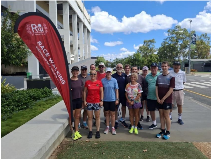
The class of 2025 – and the sport is Race Walking