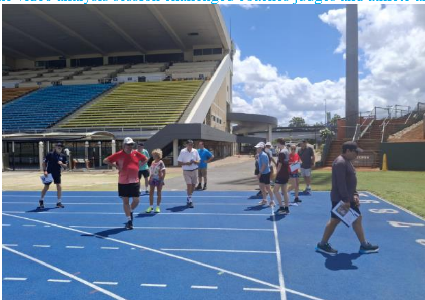
Practical did mean practical! Well done to those who had never race walked before