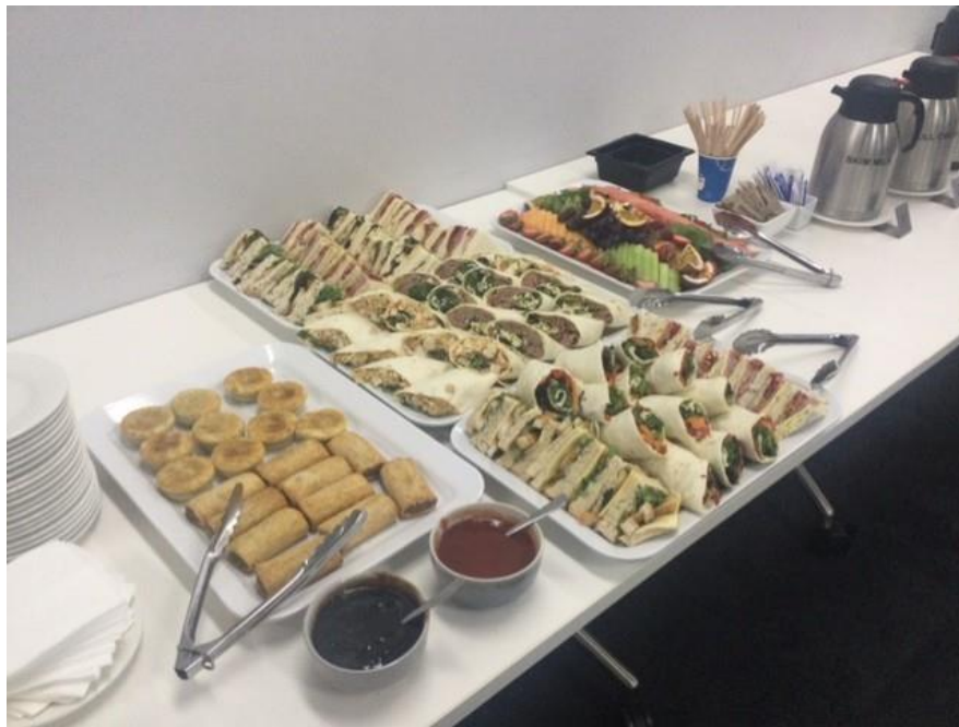
Everyone enjoyed the delicious lunch to keep their strength up

“I just loved being there, listening, taking in new info and trying it out on that amazing track. Have been making notes today.... lots of concepts to take home and incorporate.”