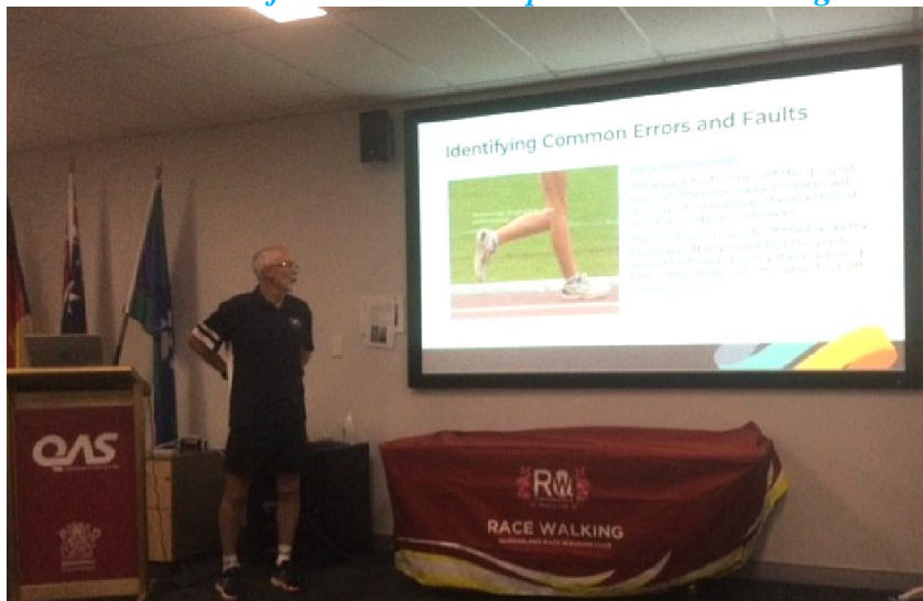
The video analysis session challenged coaches judges and athlete alike